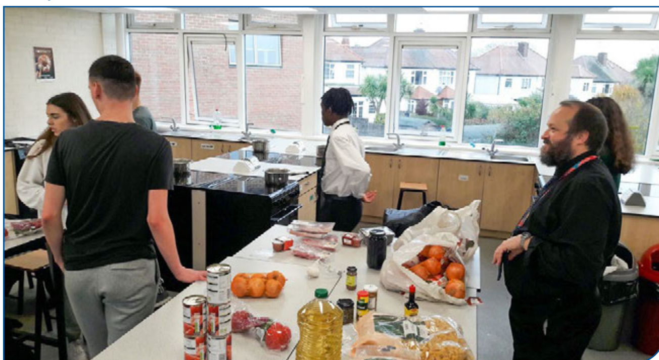
▼ 'Bootcamp' cookery course

Throughout the lockdowns, we have endeavoured to keep pupils connected with school - in addition to the remote learning