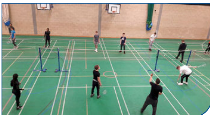
▲ Covid-19 safe physical activity